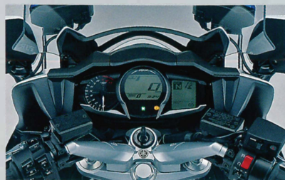
The three-part instrument panel (multi-dot LCD).

A 15 km/hr cruise control mode reduces driver fatigue when participating in parades and slow-speed escorts.