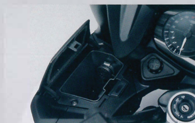
On the left inside of the cowling is a lockable glove compartment that works off the main key for added security.