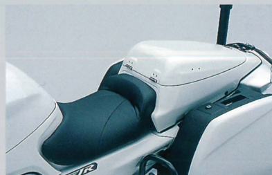
A comfortable seat cushion comes with a two-step height adjustment (20 mm).