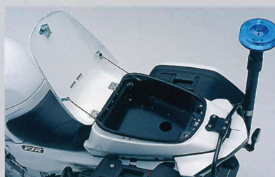
Large rear box for radio equipment.