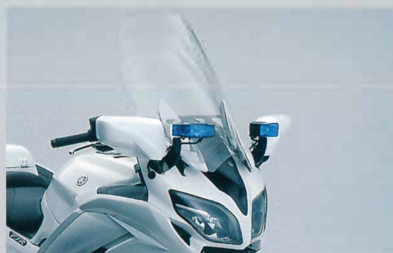
Electrically adjustable windshield (135 mm vertical range) ensures high-speed wind protection. Handlebar is 20 mm higher than civilian model.