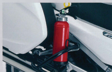
The rear bumper with a fire extinguisher holder.