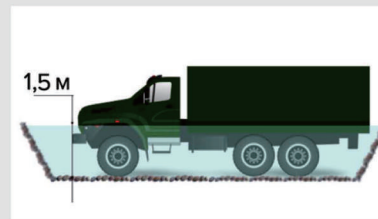
Fording Depth 1700 mm