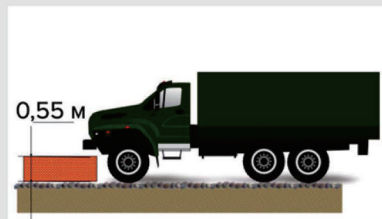
Obstacle height - 550 mm